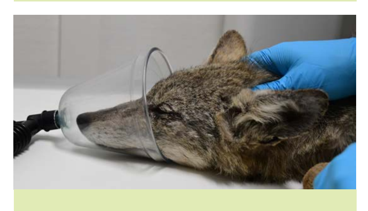
RELIEF FROM SUFFERING